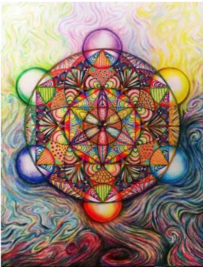
Golden Threads Mandala

Golden threads of the 5Ds weave new connections between us. They form into a Mandala with a complex multidimensional pattern.